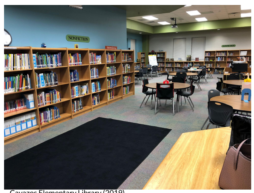
Cavazos Elementary Library (2019)